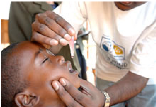
A Rotarian immunizes a child against polio in Addis Ababa, Ethiopia.