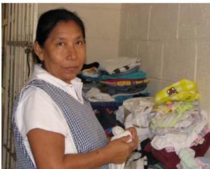
Laundry is an all day every day chore to provide clean clothes, towels, diapers and bedding for the 30 children at Amor Y Vida

For past issues of The Sparkplug , to read board minutes, to consult the board manual and club by-laws, or to look up member contact information, visit our Web site at www.decaturotary.org