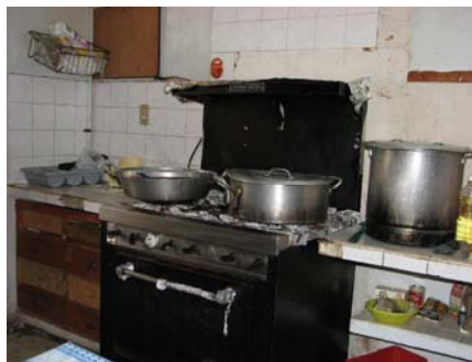
Stove and cabinets on opposite wall