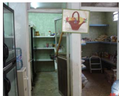
Refrigerator, freezer and pantry