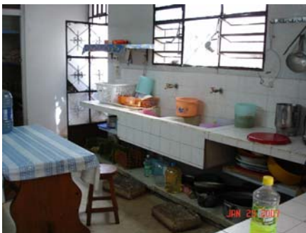
The current kitchen prep and clean-up area