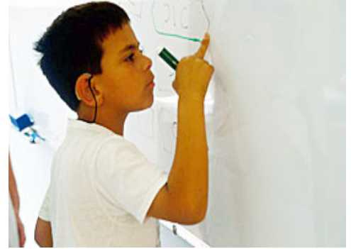
$100 helps provide a hearing aid for a child

The end of March brings us three fourths of the way through our Rotary year. We are left with three months for each of us to provide our share of support to The Rotary Foundation through the Annual Fund by contributing $100. Your donation helps our club meet the goal of giving by Every Rotarian, Every Year. Remember that if you are a first time donor to The Rotary Foundation (TRF), our club will match the first $100 with $50. Once your contributions total $1000, you become a Paul Harris Fellow.