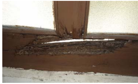
Termite and weather damaged windows