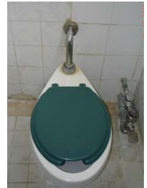
Tile work, re-hanging shower doors, and replacing toilet seats and flush valves are among the many repairs needed to the bathrooms