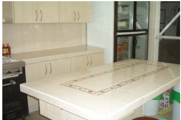
The new center island and view of the refrigerator and pantry