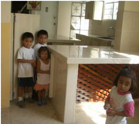
The tour begins at the entrance to the kitchen