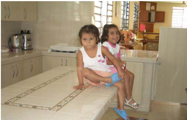
Preschoolers showing off the kitchen from premium seats