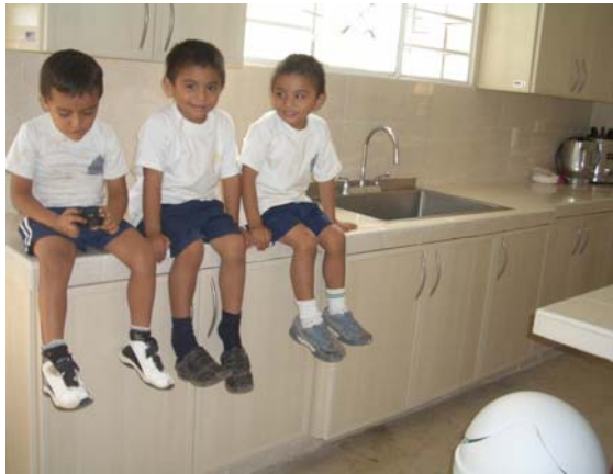
Three amigos perch on the new counter